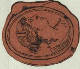
(THE IMPRESSIONS ARE LIKENESSES OF LADY H.)

FAC SIMILE EXTRACT OF LADY HAMILTON'S LAST LETTER TO LORD NELSON.