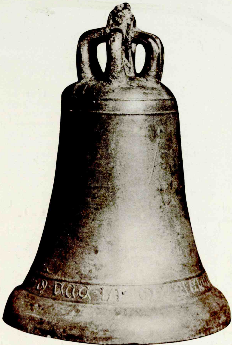
ITALIAN BELL, DATED 1351