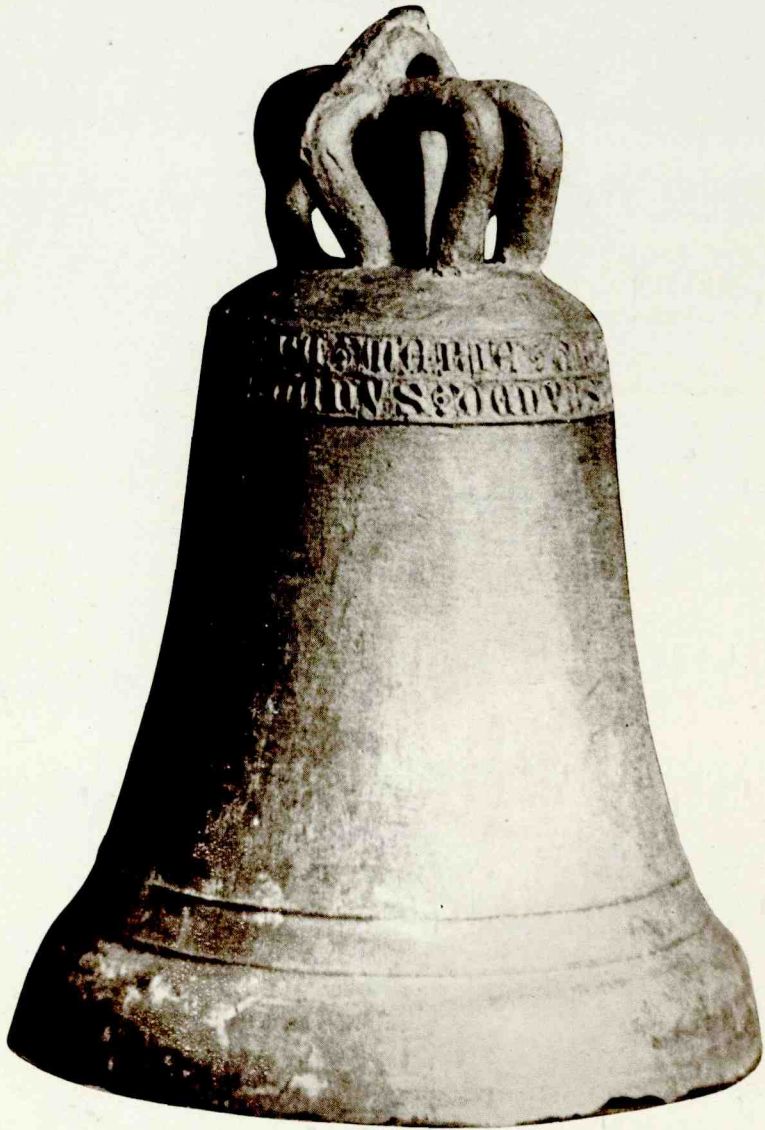
ITALIAN BELL, DATED 1471